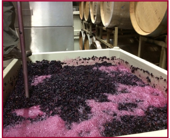
Port varietals being punched down during fermentation.

My other big wine news is that this harvest I brought in Tinta Cao, Tinta Madeira, and Touriga, all Portuguese varietals, to produce my first ever Port! The photo above shows these grapes being punched down during the fermentation process. Again, we'll all need to be patient to taste the outcome, but I promise it will be worth the wait.